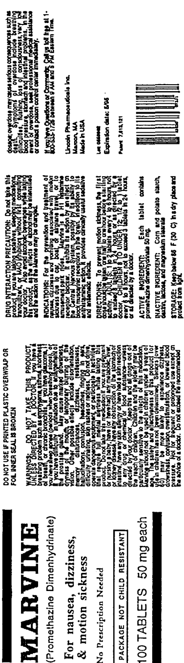
FIGURE 3 Text of the multipanel main label (front, back, and sides).