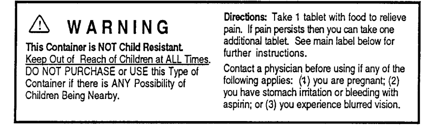
FIGURE 1 The printed material on the experimental container cap labels.

The added label message was printed in 10-point New Helvetica Narrow, a sans serif font chosen for its similarity to the font-