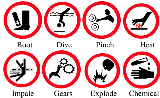
Figure 1: Eight symbols base images and referents.

Stimuli were based on common symbols already in use. Most symbols were taken from computer clip art or scans of safety catalogs such as Safety symbols and labels – New products for 2002 [9]. Some symbols were created by the first author using a computer graphics software application. Symbols used for analysis were black, while the surrounding circle and slash features were red. All symbols were presented to participants in a three-page booklet with 10 symbols per page printed on card stock. Participants were tested in groups of up to four in experimental sessions that lasted approximately 30 minutes.