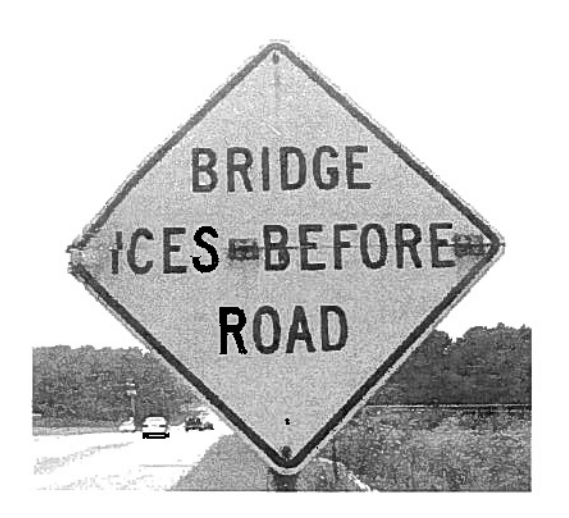
FIGURE 63.7. A sign concerning icing on a bridge displayed on a hot summer day.