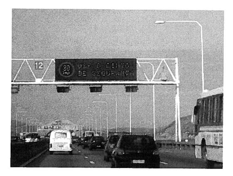
FIGURE 63.3. A changeable-message highway sign in Rio de Janeiro, Brazil. (See Color Plate 23).

One relatively recent technological innovation is the availability of flat-panel displays. High-resolution liquid crystal displays (LCDs) are now commonly purchased for use as computer monitors and high-definition televisions. Large versions of flat-panel displays (using somewhat different technologies) are also being used in sports stadiums and as advertisement billboards in big cities. Although still relatively expensive, the price associated with flat-panel displays will undoubtedly drop over time, and new uses can be considered for warning applications. One such use is in highway signs. Changeable message signs using lower-resolution technology already exist on highways in some places. Examples are shown in Figs. 63.2 and 63.3. Eventually, warning signs on highways and smaller signs in other applications will use high-resolution technologies such as those used in flat-screen LCD monitors. One benefit of these displays is that they are backlit, bright, and have high contrast, and thus are more likely to attract attention in most ambient light conditions compared with conventional signs. Most important, a