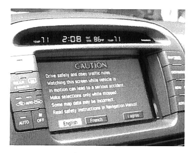
FIGURE 63.5. An in-vehicle navigation system display showing a warning.

of Chy-Dejoras (1992) suggested that video displays can be an effective means of conveying safety information.