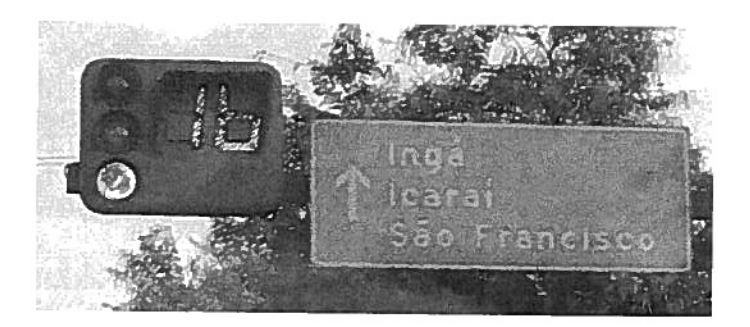
FIGURE 63.2. A traffic signal countdown sign. (See Color Plate 22).

methods of displaying warnings made possible by new technology are described. Their purpose is to facilitate warning delivery.