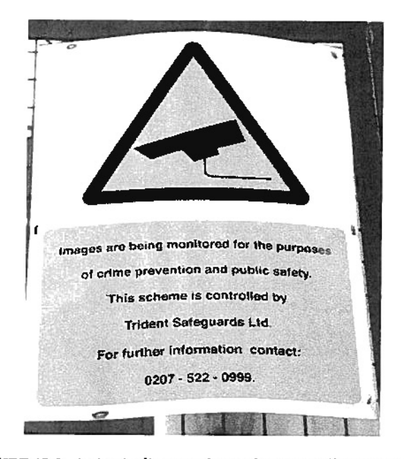
FIGURE 63.9. A sign indicating that video surveillance is being conducted.