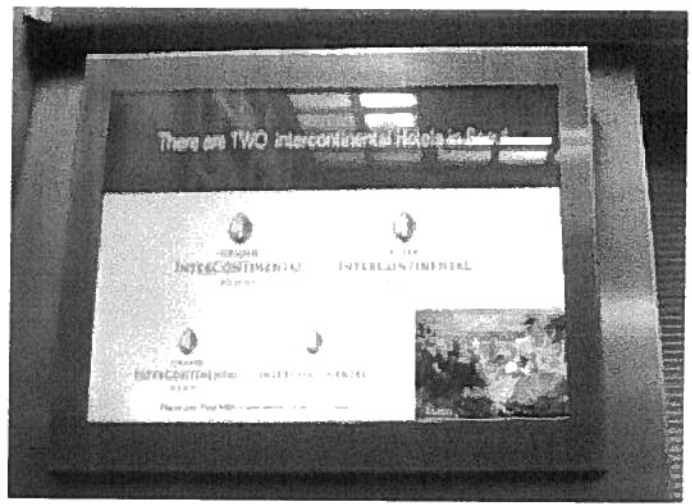
FIGURE 63.4. A high-resolution LCD display in a hotel elevator.

major benefit of these devices is that the information content displayed on them can be changed as needed. Figure 63.4 shows a high-resolution display in a hotel elevator. Such a display could provide warning information (such as an urgent instruction to exit the elevator immediately in case of a fire in the building) or other pertinent instructions. The same kind of device, but somewhat larger, could be mounted elsewhere in a building (e.g., on walls, posts, etc.) to display warning information as appropriate. It could be displayed in remote places, powered by solar cells. Of course, these devices would need to be protected so that vandalism and the elements do not threaten their operation.